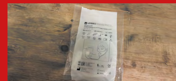
PAEDIATRIC NASAL END TIDAL CO2 DEVICE: £9