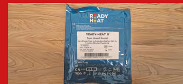
WARMING BLANKET: £33