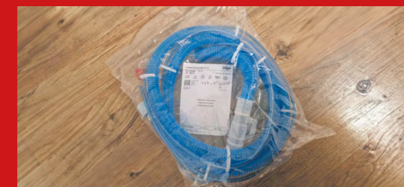
PAEDIATRIC VENTILATOR CIRCUIT: £49